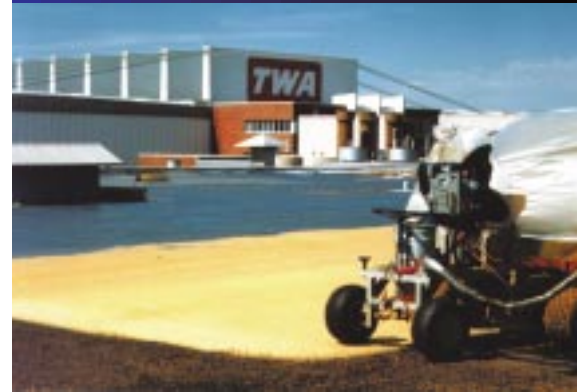
Robotic 'Romer' Applicator