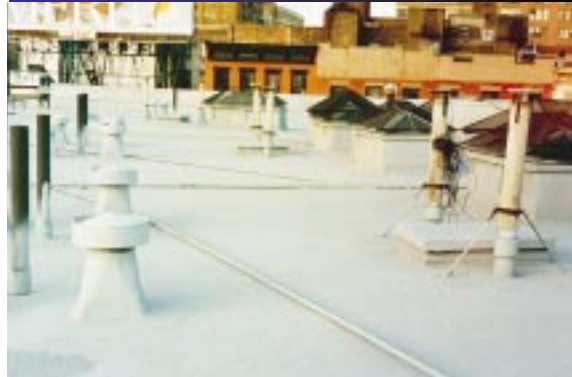
Same roof... leak free after SPF

"For years I've heard from roofing experts that there are problems with all roofing systems. After applying over 6 million sq. ft. at this location I can state there are virtually no problems with our SPF roofs."