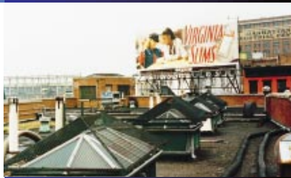
Problem-plagued conventional roof